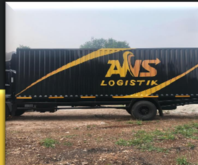
FUSO LONG BOX

Tronton WB : P = 10,5 L = 2,5 T = 2,5 Capacity : 20 MT & 55CBM