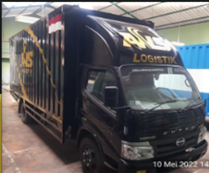
CDD LONG BOX

CDD Long : P = 7,2 L = 2,1 T = 3,3 Capacity : 8,2 MT & 24 CBM